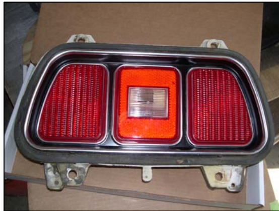
Newly assembled tail light

Once you have cleaned the inside of the housing and cleaned the sealing gasket it is time to reassemble the taillight. Place the gasket in the housing and carefully set the new lens into the attaching slots.